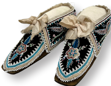
Artist Unknown, Pair of Huron Moccasins , c. 1845. Quebec, Canada. Velvet, beads, ribbon, and leather. 2.5 x 3 x 9.25 in. NA0313