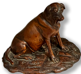
Artist Unknown, Untitled , c. 16th C. Germany. Boxwood, 2.5 x 3 x 2 in. EU0004